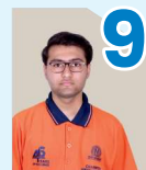
Shah Tejas Twinkle nPrep