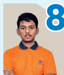
Diganth S Classroom Student